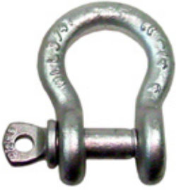
Screw pin anchor shackles meet Federal Specification RR-C-271D, Type IVA Class 2, Grade A

Material: Forged 1030 Carbon Steel Finish: Self-Colored, Hot Galvanized