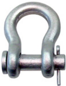
Round pin anchor shackles meet Federal Specification RR-C-271D, Type IVA Class 1, Grade A

Material: Forged 1030 Carbon Steel Finish: Self-Colored, Hot Galvanized