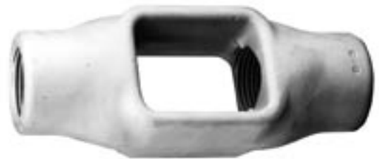
Sizes 1 7/8" to 4 1/2"