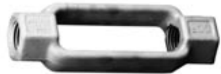
Sizes 3/8" to 1 3/4"